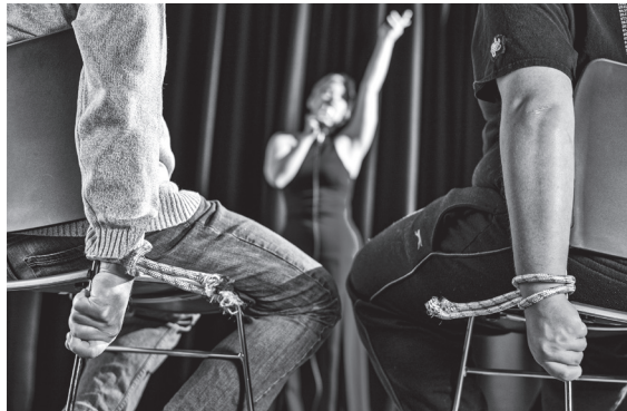
■ A and B sit with hands tied to their sides.

Sometimes, Zeus would watch through the window as she mounted Yul's body.